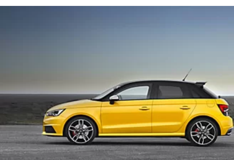
No more Car Loan. For owning a Car. Zoomcar ZAP