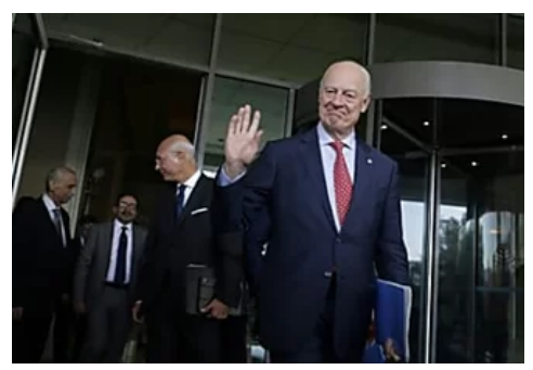
UN envoy talks new constitution with Syria FM France 24