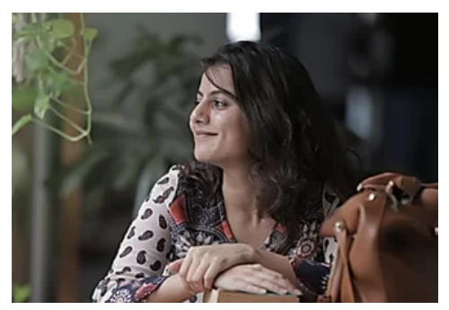
10 Insulin Myths People With Diabetes Shouldn't Believe LifeToTheFullest.Abbott